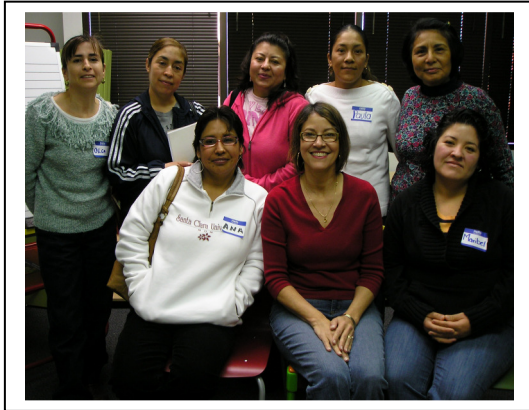
Participants in the Focus group conducted in November 2009