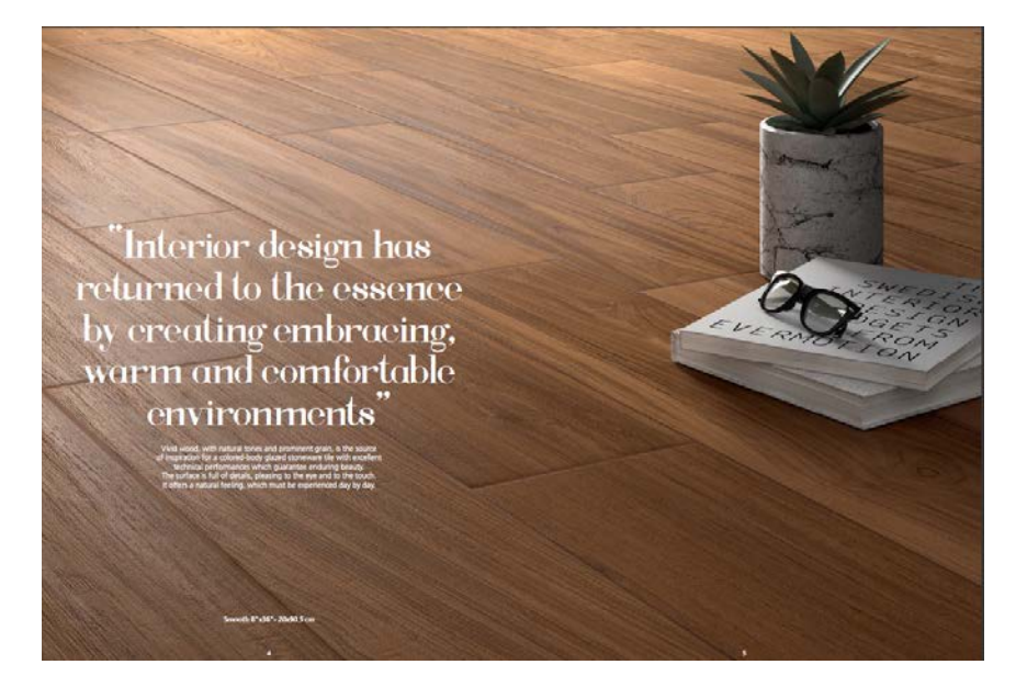
Layout shown is similar to proposed "brick" pattern.