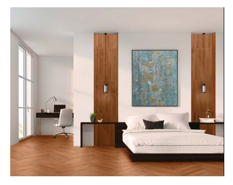
Layout shown is not "brick" pattern. Image for color reference only.