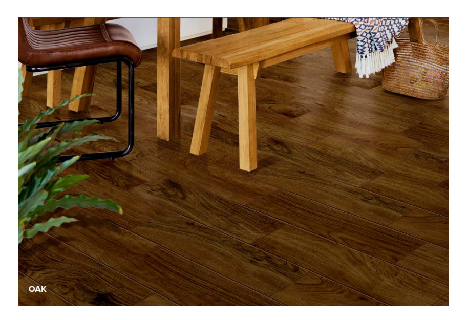
Layout shown is similar to proposed "brick" pattern.