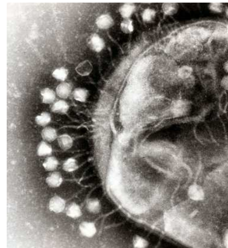
Bacteriophage infecting bacteria